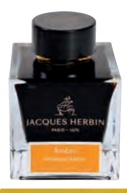
Amber /41J I